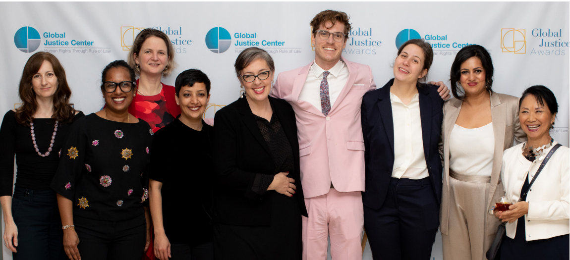
BOTTOM: GJC friends and partners on Women, Peace and Security