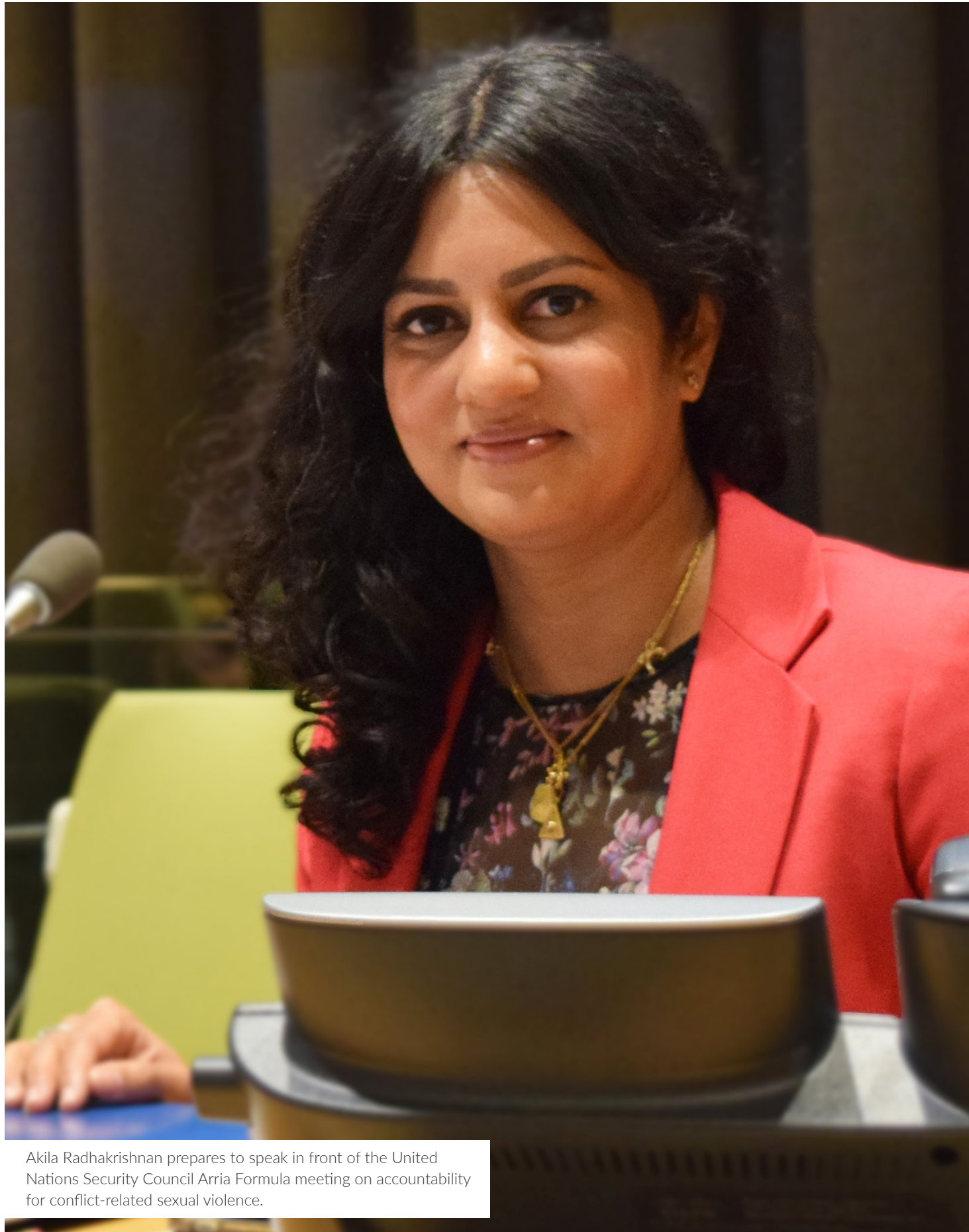
Akila Radhakrishnan prepares to speak in front of the United Nations Security Council Arria Formula meeting on accountability for conflict-related sexual violence.