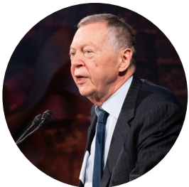
ARYEH NEIER Presenter