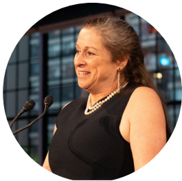
ABIGAIL DISNEY Feminist Voice Honoree